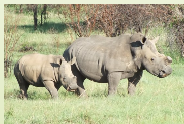
Pilanesberg National Park