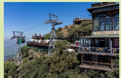
Harties Cable Way

While staying at Desnudo, you will visit Lesedi Cultural Village and Harties Cable Way.