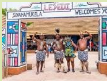
Lesedi Cultural Village