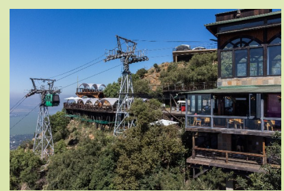
Harties Cable Way

While staying at Desnudo, you will visit Lesedi Cultural Village and Harties Cable Way.