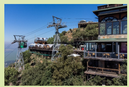
Harties Cable Way

While staying at Desnudo, you will visit Lesedi Cultural Village and Harties Cable Way.