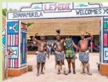
Lesedi Cultural Village