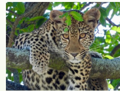
Kruger National Park