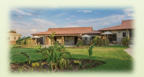
Go on Safaris in the Pilanesberg National Park and see some of the Big 5 and then relax at the pool.

On the way to Marloth Park, we will stop at ALZU, where you can see more animals. Enjoy Safaris in the Kruger National Park where you can see some of the Big 5, and you can relax at the pool while watching more wild animals near the house.