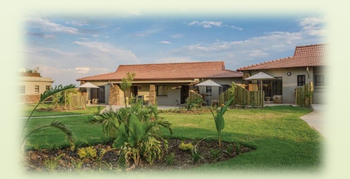
Go on Safaris in the Pilanesberg National Park and see some of the Big 5 and then relax at the pool.