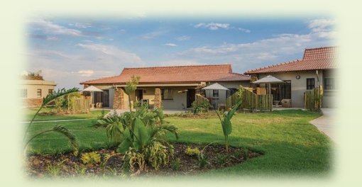
Go on Safaris in the Pilanesberg National Park and see some of the Big 5 and then relax at the pool.

On the way to Marloth Park, we will stop at ALZU, where you can see more animals. Enjoy Safaris in the Kruger National Park where you can see some of the Big 5, and you can relax at the pool while watching more wild animals near the house.