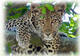
Kruger National Park