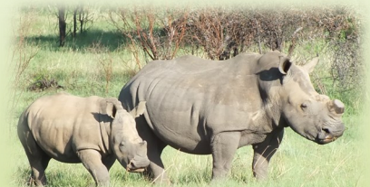
Pilanesberg National Park