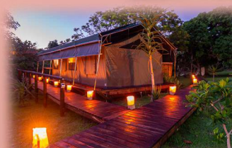
Kingfisher Lakeside Retreat