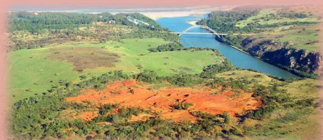
World's smallest desert