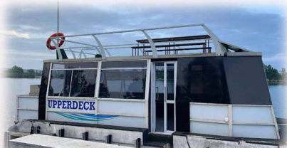
Boat Trip on the Vaal River