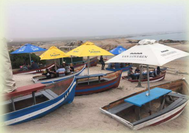
Seekombuis - Paternoster

Spend the first week in Cape Town where you will visit Table Mountain, Boulders Penguins, Cape Point, two wine farms, the V&A Waterfront and visit Sandy Bay, the famous naturist beach.