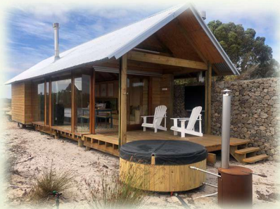
!Khwa ttu, West Coast

Spend the first week in Cape Town where you will visit Table Mountain, Boulders Penguins, Cape Point, two wine farms, the V&A Waterfront and visit Sandy Bay, the famous naturist beach.