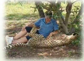
Lion and Cheetah Sanctuary

While staying at SunEden you will go on a Safari in Dinokeng Game Reserve where you might see some of the Big 5 and visit the Lion and Cheetah Sanctuary.