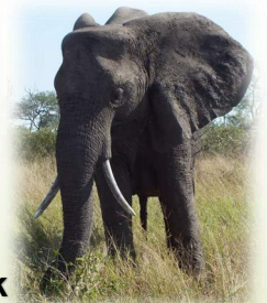
Kruger National Park