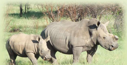
Pilanesberg National Park