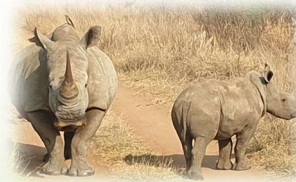
Kruger National Park