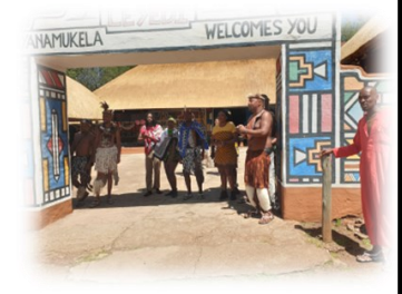
While staying Desnudo, you will visit Harties Cableway and Lesedi Cultural Village.