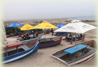
Seekombuis - Paternoster

Spend the first week in Cape Town where you will visit Table Mountain, Boulders Penguins, Cape Point, two wine farms, the V&A Waterfront and visit Sandy Bay, the famous naturist beach.