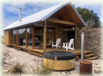
!Khwa ttu, West Coast

Spend the first week in Cape Town where you will visit Table Mountain, Boulders Penguins, Cape Point, two wine farms, the V&A Waterfront and visit Sandy Bay, the famous naturist beach.